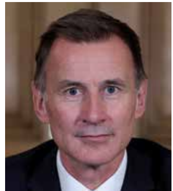
Official portrait of Jeremy Hunt MP